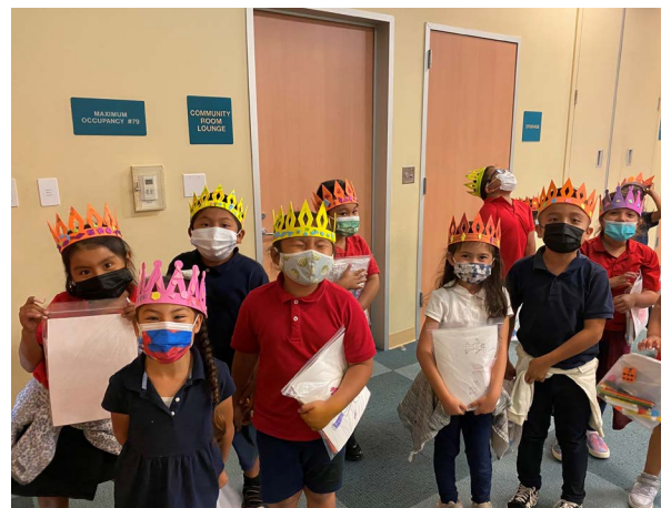
Photo: Children showing off their projects at a Vida Latina Bibliodías workshop at the Mark Twain Neighborhood Library.

In September and October, the Library hosted its third annual Vida Latina celebration in honor of Latino Heritage Month. Vida Latina is a series of in-person and virtual family events including bilingual storytimes for young children, Spanish short story readings for teens and adults, and a Community Lotería Night for all ages. Thanks to a generous contribution from Farmers & Merchants Bank, the Library Foundation funded this year's festivities that highlight the rich cultures of Latinos in Long Beach.